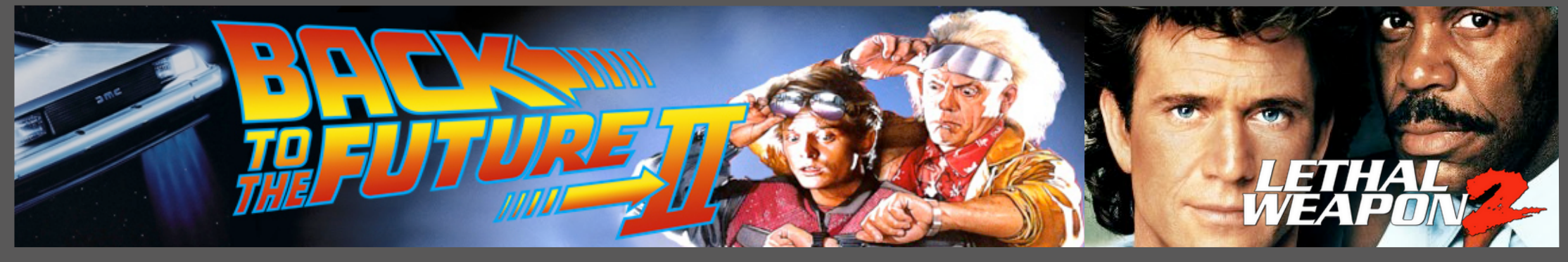
Sunday 22nd September