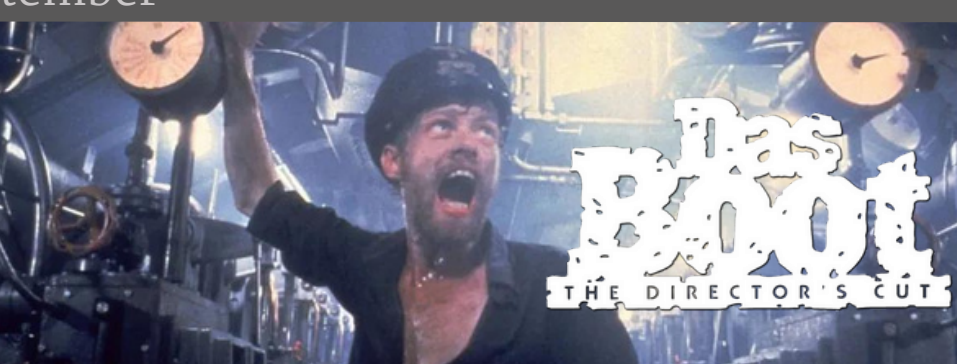
Sunday 8th September