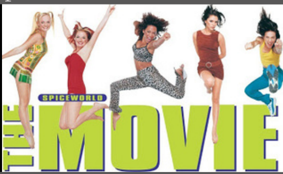
Saturday 7th September