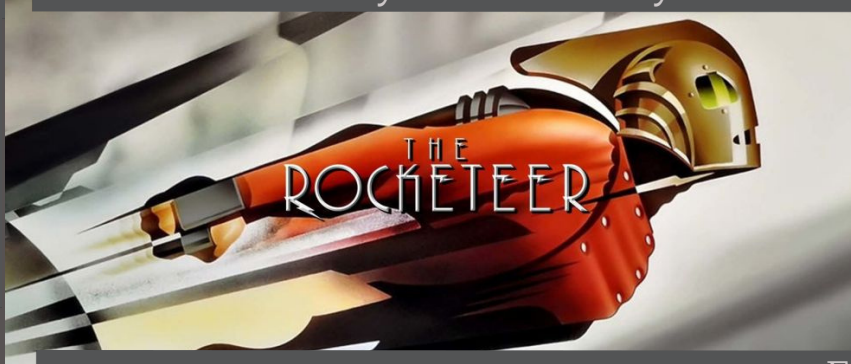
Thursday 27th February